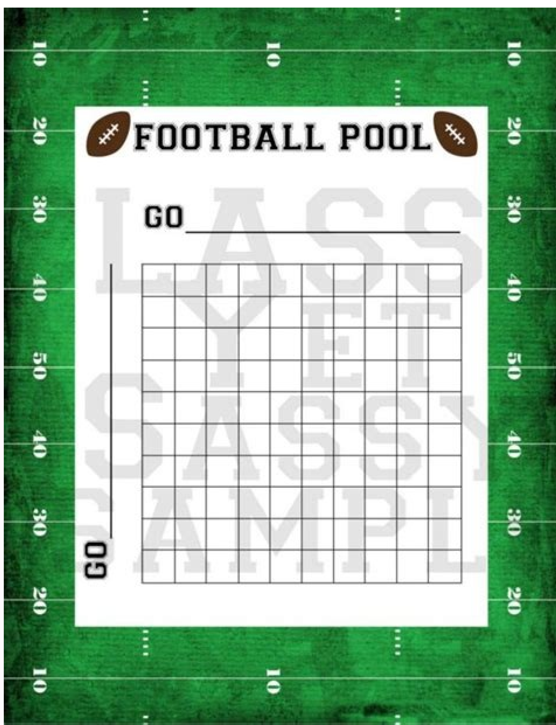
Squares game template printable.